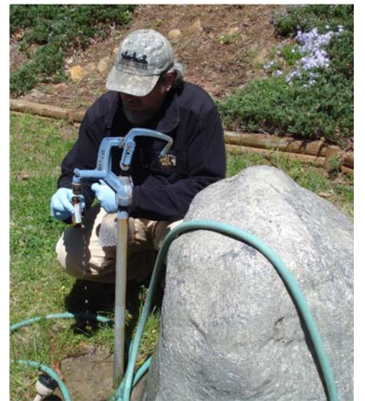
AMEC personnel collecting a well water sample in April 2014

The 2<sup>nd</sup> quarterly drinking water sampling event of 2014 was completed during the week of April 14-18, 2014. EPA will mail results to home owners after the results are received.