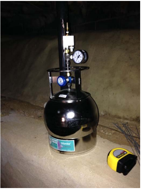
April 2014 – Summa canister collecting a crawl space air sample over a 24-hour period.

A few months ago, the property owners adjacent to the eastern fence line gave CTS Corporation and EPA permission to conduct the VI assessment on their properties. EPA approved AMEC's revised Vapor Intrusion Assessment Work Plan (Revision 4) on March 28, 2014, and sampling was conducted on the properties to the east of the fence line during the week of April 21-24, 2014. The sampling report is expected to be received by EPA in June.