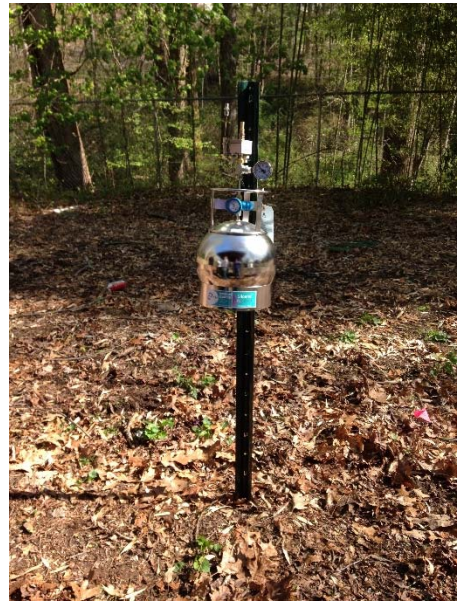
April 2014 - Summa canister collecting an outdoor air sample over a 24-hour period.

In 2012, AMEC conducted a Vapor Intrusion (VI) Assessment at several homes within Southside Village, which is adjacent to the western fence line of the former CTS manufacturing building. The results indicated that concentrations were within acceptable levels for residential land use.