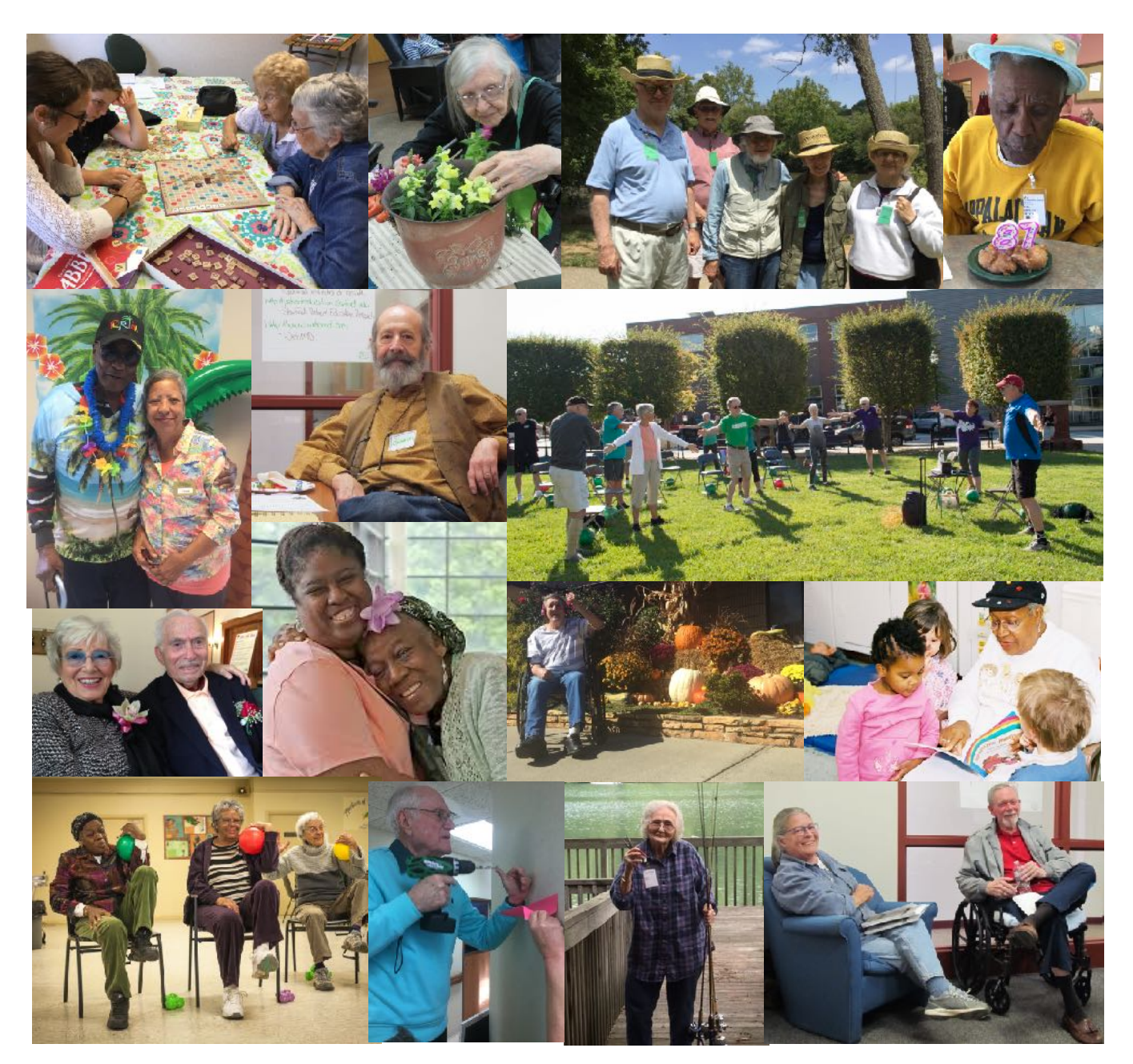
Presented to the Buncombe County Board of Commissioners