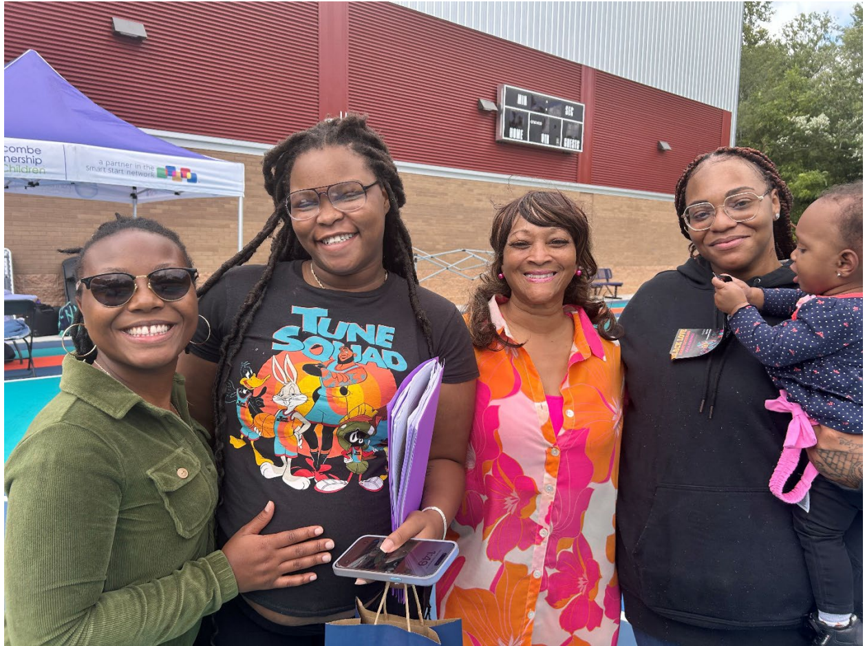
Project NAF Staff with Project NAF Participants & Baby during the “GET REAL” Health Fair on September 14, 2024, at the Dr. Wesley Grant Sr. Southside Community Center.