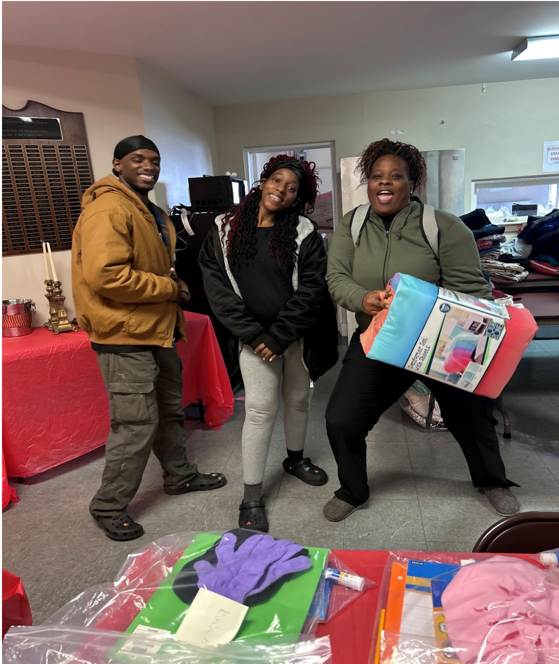
Project NAF Families having fun during the Christmas Event & Hurricane Helene Supply Give Away December 14, 2024