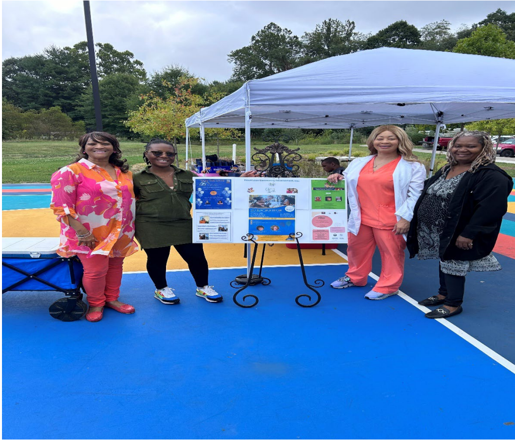
Mount Zion Community Development, Inc. initiated and collaborated with the Dr. Wesley Grant Sr. Southside Community Center on September 14, 2024, for the “GET REAL” Health Fair R esources, E ducation A dvocacy, and L ive H ealthy for a L ifetime.