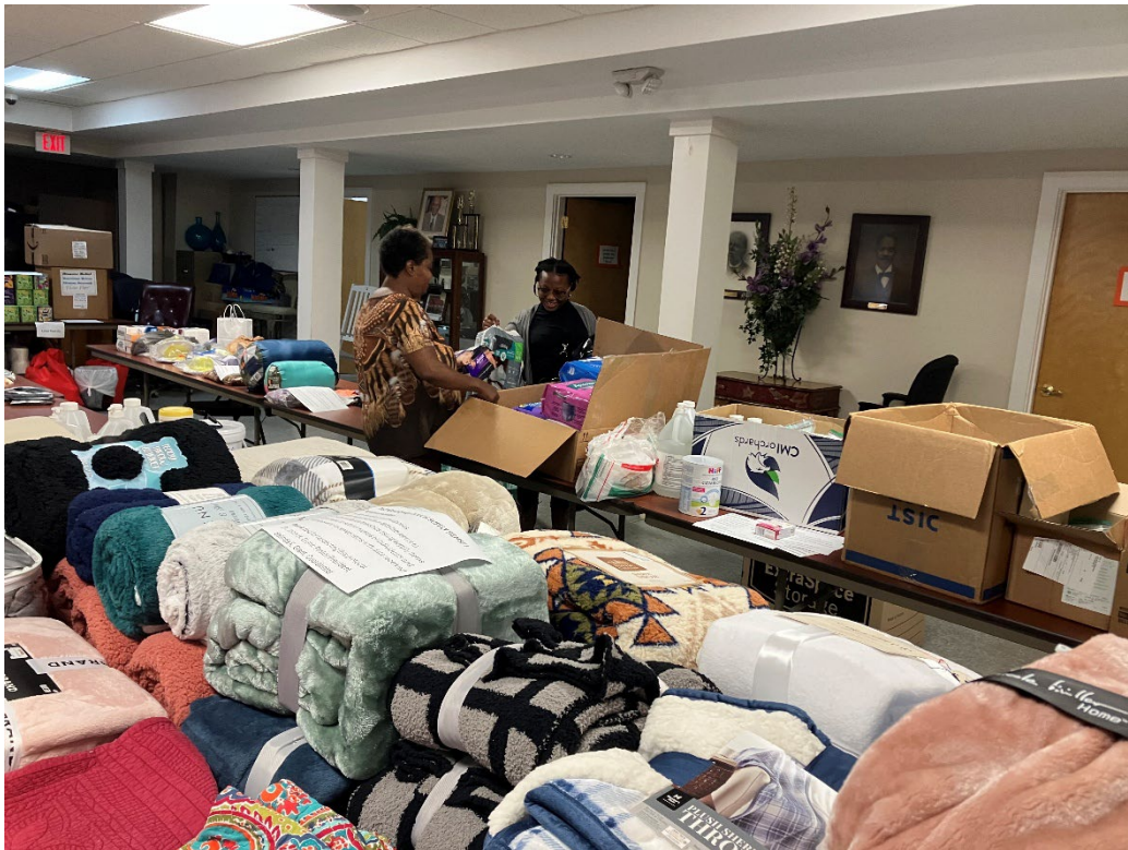
MZCD staff assembling Hurricane Helene Donations Hurricane Helene community outreach give away supplies October- December 2024. Additional outreach activities will be held