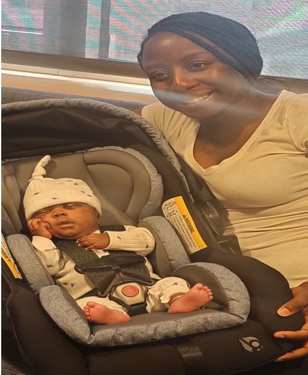
Project NAF Outreach Worker accompanied Project NAF Participant and her baby to a well-child visit.