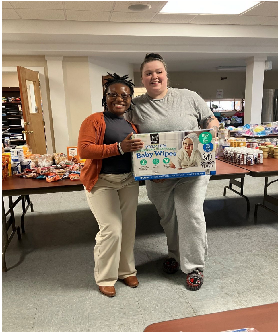
A community member visits and receives supply items during Hurricane Helene's Community Outreach events hosted by Mt. Zion Missionary Baptist Church of Asheville, Inc. & Mount Zion Community Development, Inc.