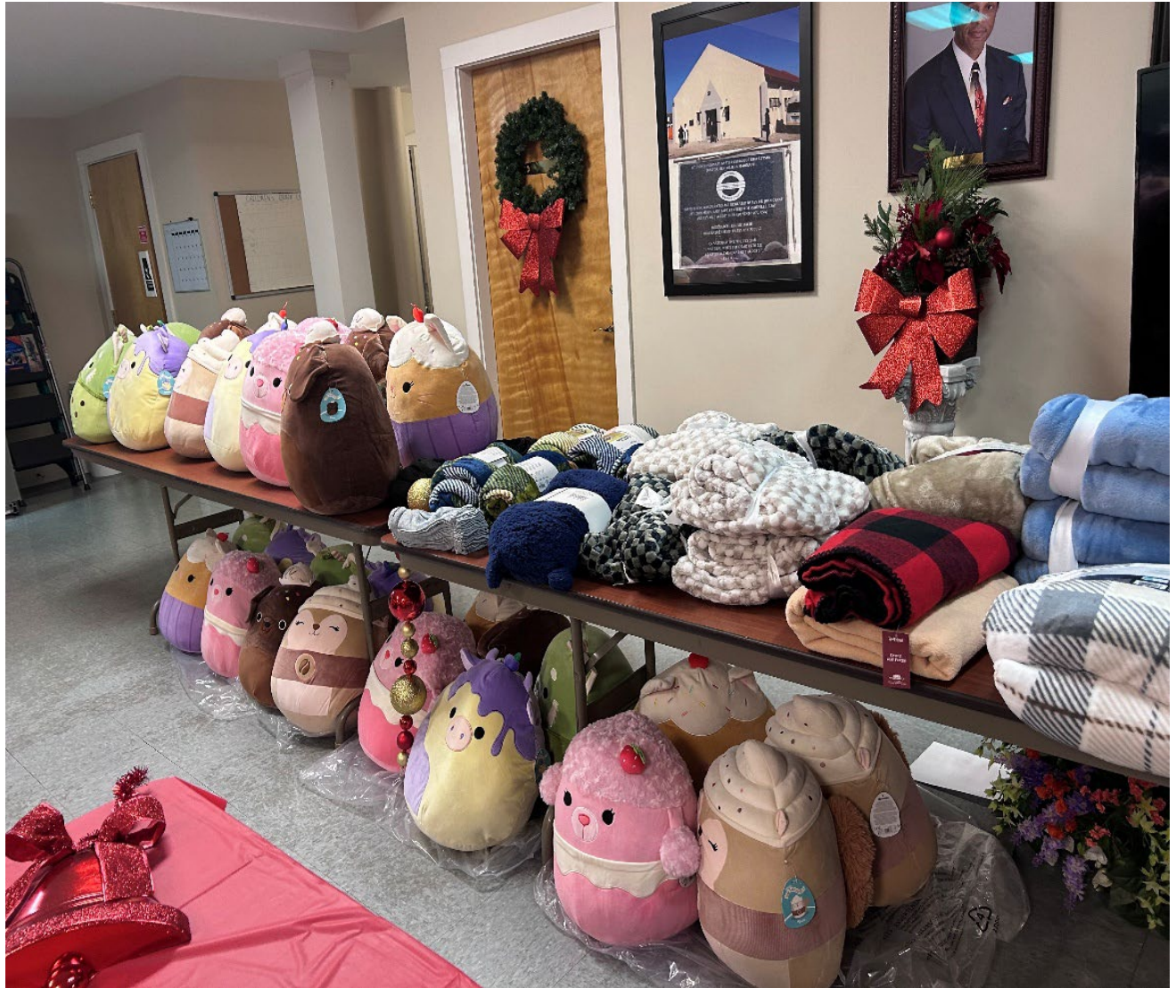
Squishmallows donated by Buncombe County Partnership for Children Project NAF Christmas Give Away & Hurricane Helene Supplies Gifts of appreciation (partial showing) December 14, 2024