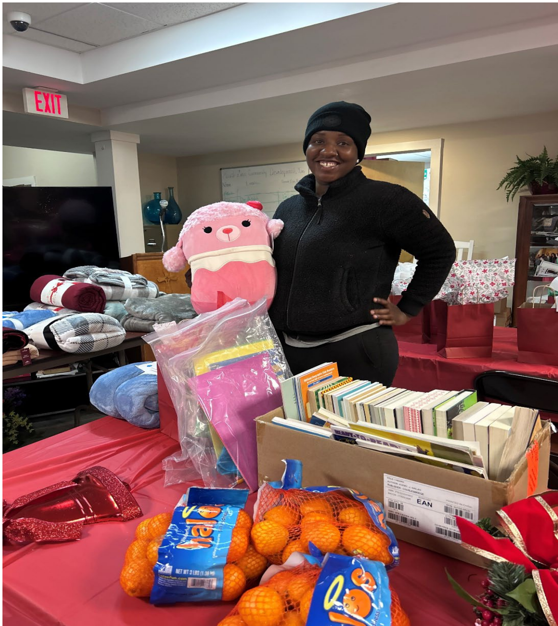
A Project NAF participant attends Project NAF's Christmas Celebration Event Hurricane Helene supplies provided as well December 14, 2024