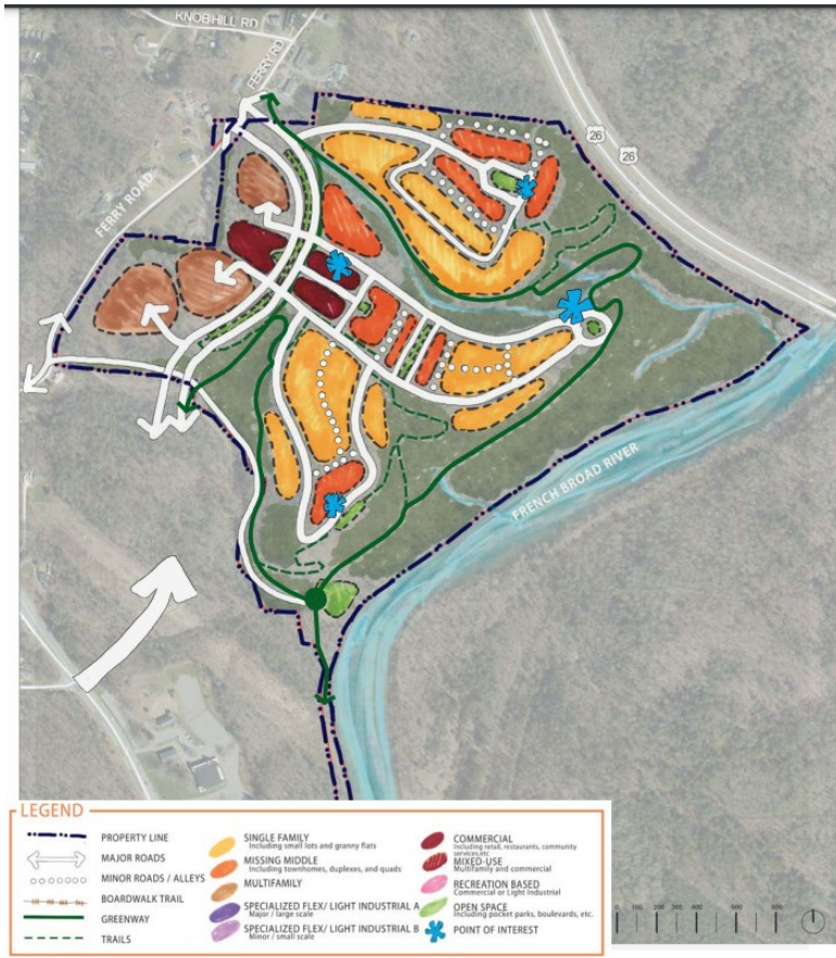
Actual design subject to change