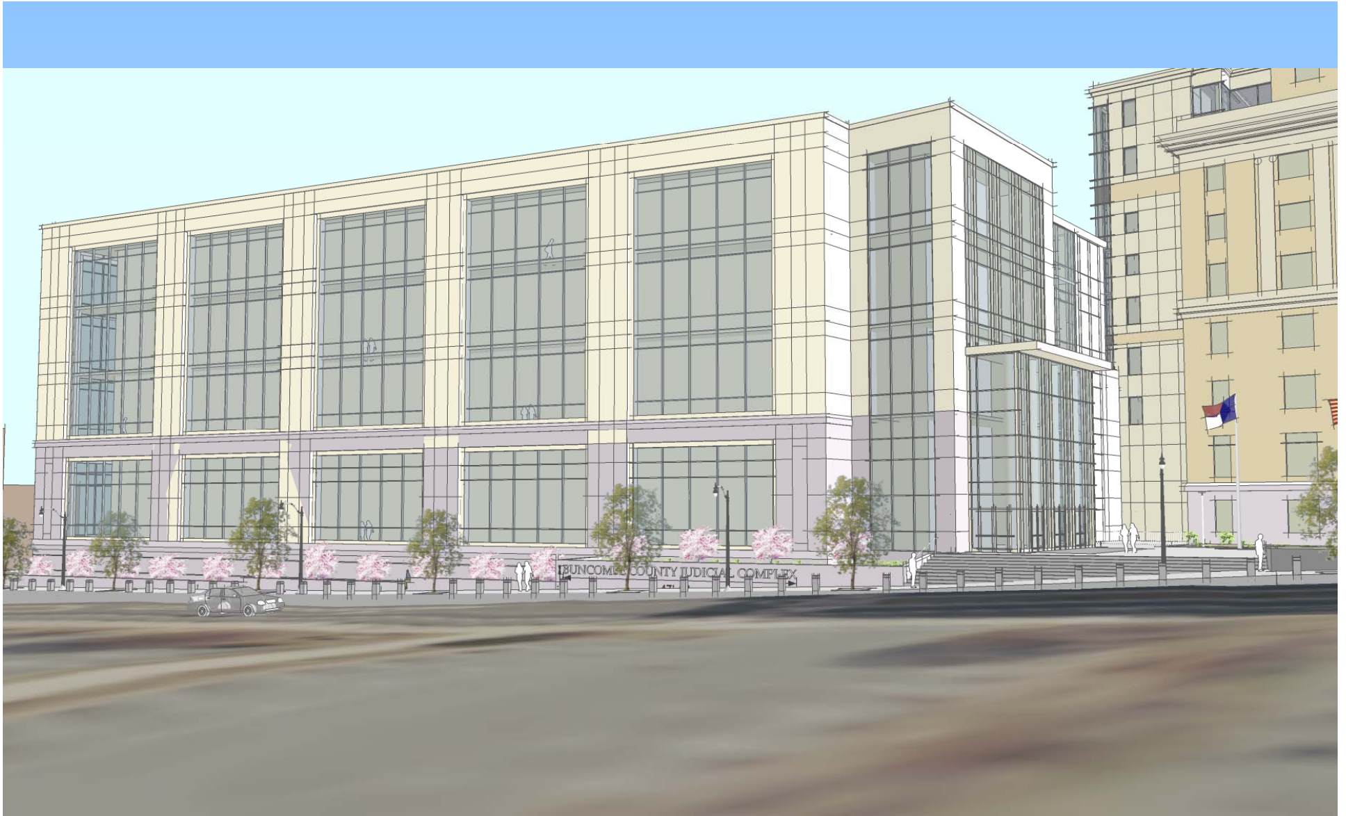
LEED Certified Courts Building