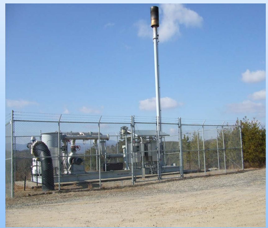
Methane Flare Station Reduces Greenhouse Gas Emissions