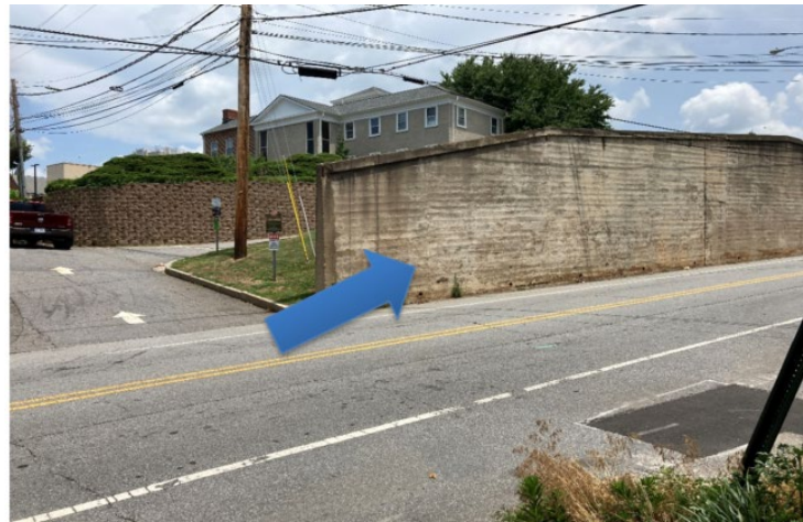
Hilliard St. Wall behind the Tax office at 94 Coxe Ave.