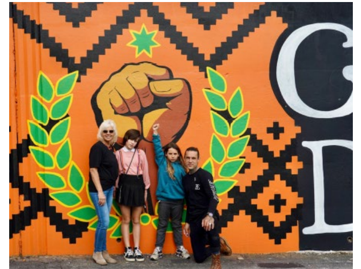
College St. Parking Deck