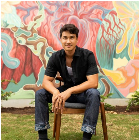
Register of Deeds Building