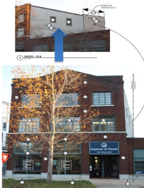
Register of Deeds building at 205 College St.