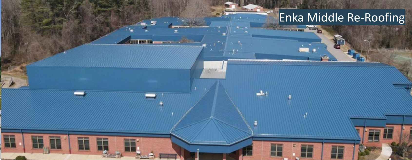
Enka Middle Re-Roofing