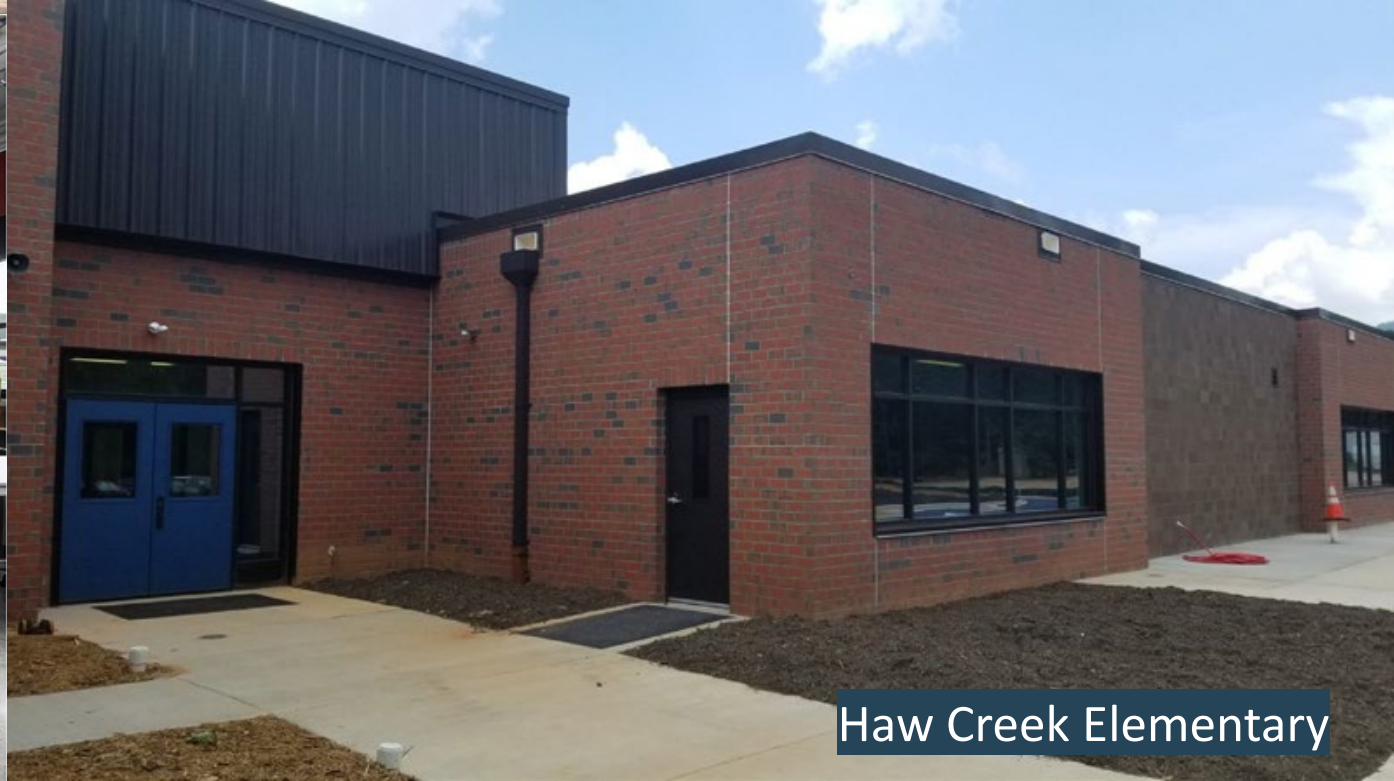
Haw Creek Elementary