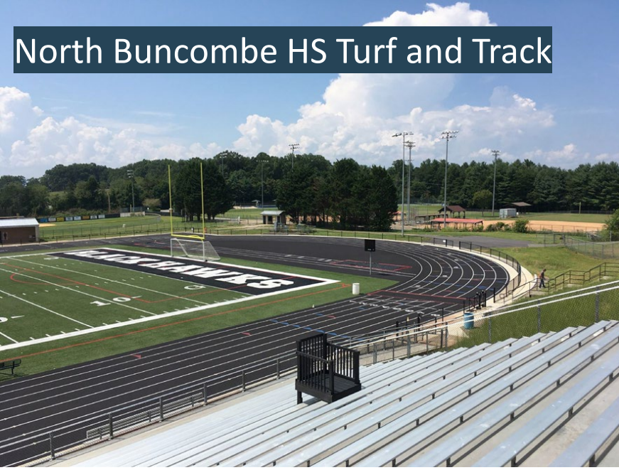
North Buncombe HS Turf and Track