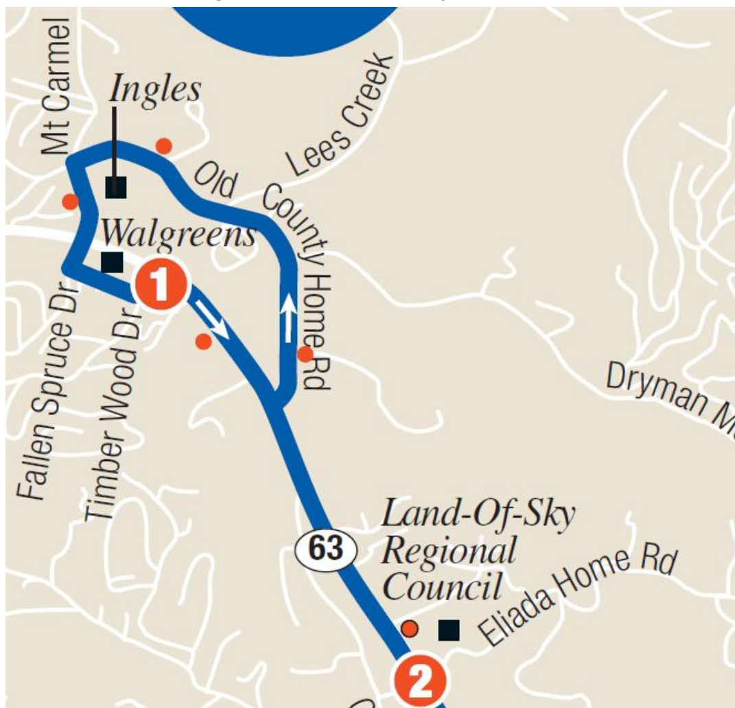
Figure 1. Proposed County Extension

At this time, the City of Asheville has not included costs associated with new bus stop infrastructure in the request. Initially, the City plans to install basic transit signage at each new stop, however additional infrastructure, such as benches, shelters, and sidewalks may become necessary in the future, at which point the City would work with the County to identify funding partnership opportunities.