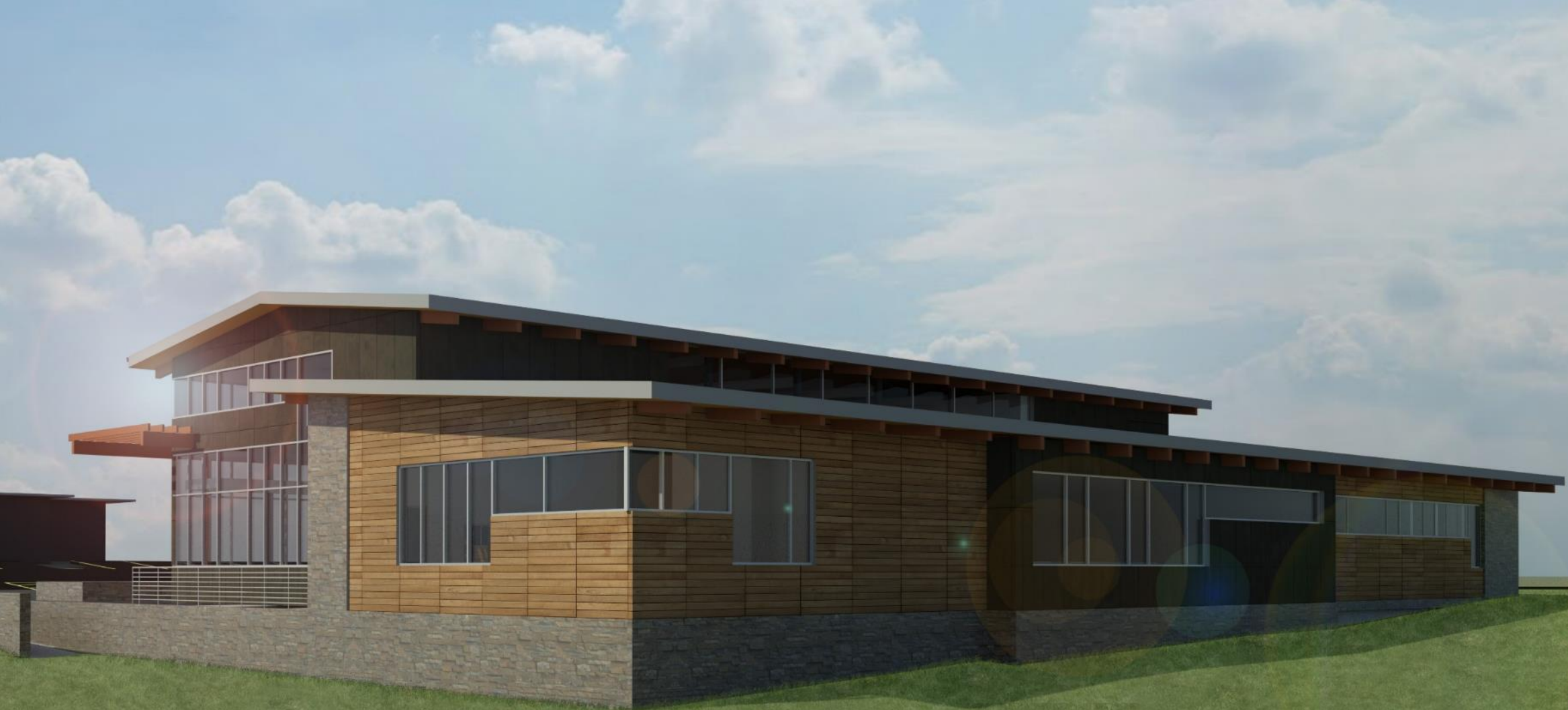
VIEW FROM PLAYGROUND LOOKING SOUTHWEST