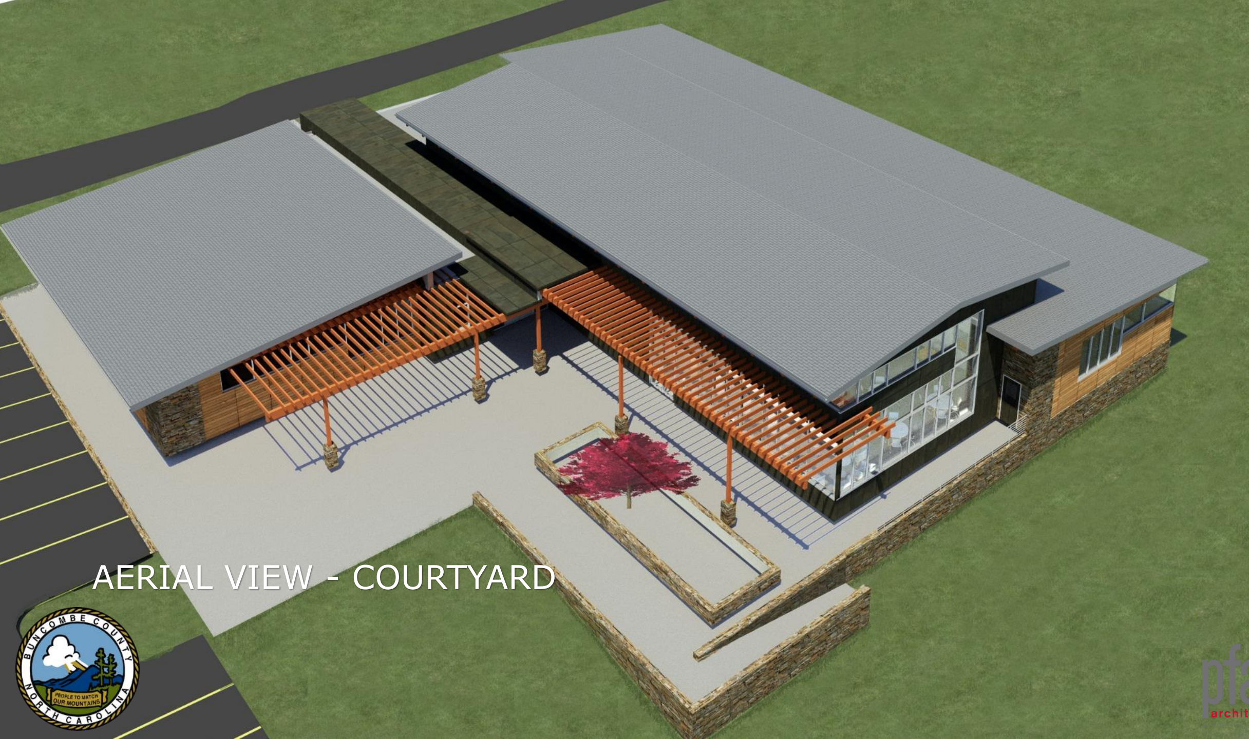
AERIAL VIEW - COURTYARD