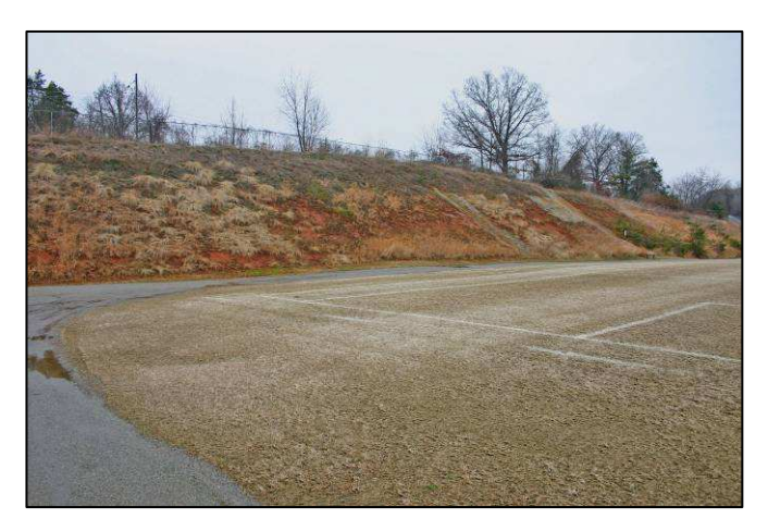
Buncombe County Sports Complex Before and after CCAP seeding project

The total CCAP allocation for the 2010 fiscal year was $11,886. These funds came from two sources. $3,723 was from State Appropriations and $8,163 was from a Clean Water Management Trust Fund Grant the Division received. Two contracts were written and one was completed.