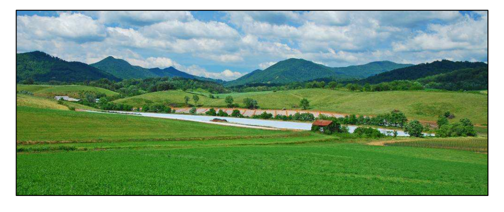
Newfound Creek Watershed