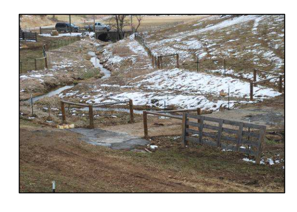
Stream restoration project one year after completion, with concrete extensions to stream crossing

A grant application to work in the Cane Creek Watershed was submitted to EPA 319 working for $360,707. Cane Creek has been listed on the EPA 303d list since 2006 for biological impairment. The goals of the grant are to identify stressors and sources of impairment, develop Watershed Management Plan, and installation of agriculture BMPs.