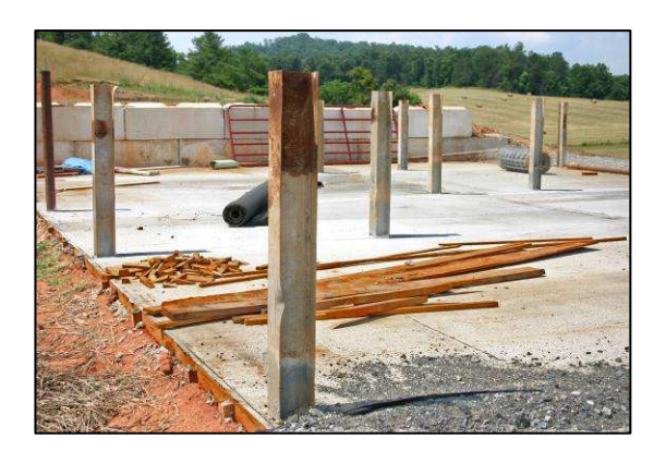
Animal waste storage facility during construction phase in Leicester (cost shared by NCACSP)

The District is required to conduct an annual spot check of 5% of all active NCASCP contracts. This task is done by staff and members of the Board of Supervisors. The goal of the spot check is to determine whether cost-shared BMPs are being maintained for their intended purpose. This year's spot check was conducted in May of 2010 on six farms in the county. All spot-checked items were in good condition and functioning as they were intended.