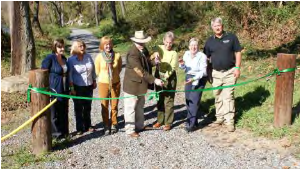
The ribbon-cutting for the trail at Alexander Park in 2011 brought about a new era for Buncombe County as it is the first greenway segment constructed and managed by the County.

Before the planning process began, Buncombe County identified several themes to examine during the course of the effort. An integral, over-arching theme was one of creating a meaningful, vibrant and affordable practice today that does not deplete the County's resources for tomorrow. This must be achieved in a fiscally responsible way and with an outcome that is compelling and understood by the people who use it and need to live with it. These themes are consistent with those found in the County's Land Use Plan and Sustainability Plan.