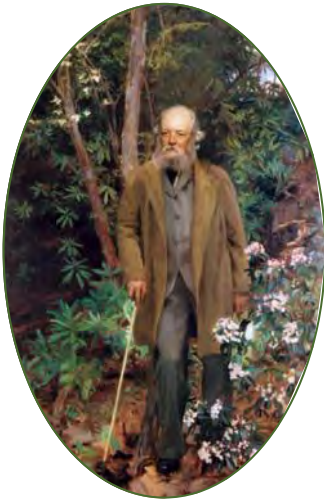
Frederick Law Olmsted could be considered the father of greenways in America through his work on incorporating natural features and trails into urban public works projects.

Portrait of Olmsted from the Biltmore Estate