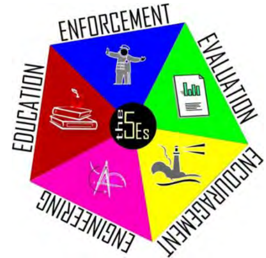
The 5E’s associated with developing a greenway plan, which were incorporated into the Buncombe County Greenways and Trails Master Plan.

Encouragement is inclusive of how a community promotes and encourages use and stewardship of its greenways and trails through volunteers, schools, non-profit organizations, land conservancies, bicycle clubs, organized events, promotional materials and marketing, maps of all types of greenways and trails, and Safe Routes to Schools programs. The development of other facilities such as sports fields, running tracks, river access points,