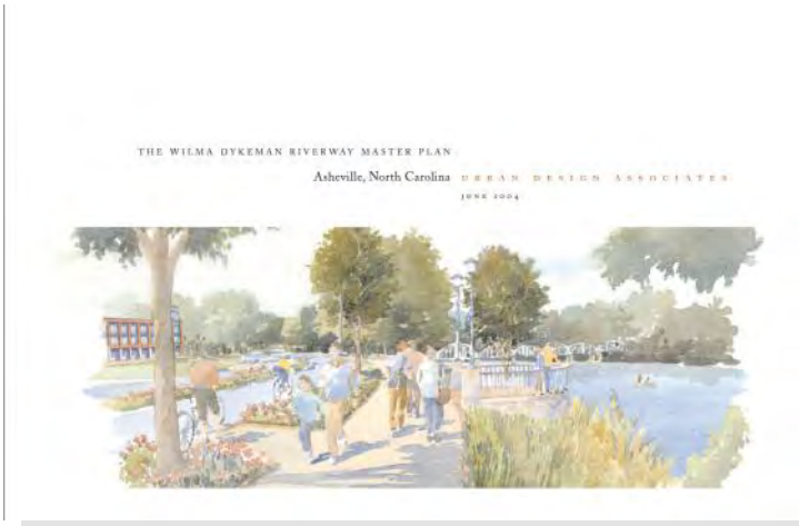
The Wilma Dykeman RiverWay Master Plan (2004) remains one of the key guiding documents for greenway development and environmental protection in the French Broad River watershed. Many of the Priority Corridors in the Buncombe County Greenways and Trails Master Plan have direct connections the existing and planned sections of the RiverWay.