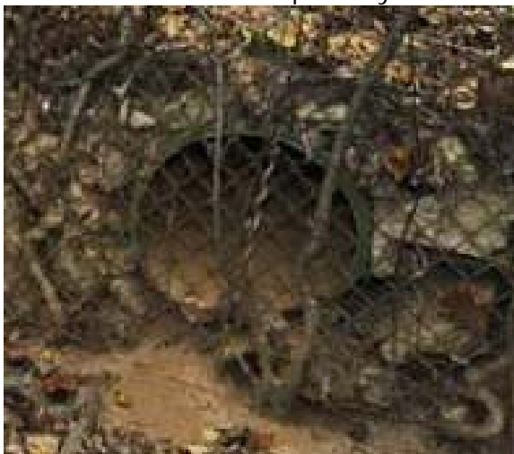
Empty barrel at the fence line near the back of the CTS Site

In the meantime, well water sampling and filtration system installation and maintenance will continue. The next quarterly well water sampling event is planned for the 2 nd week of January.