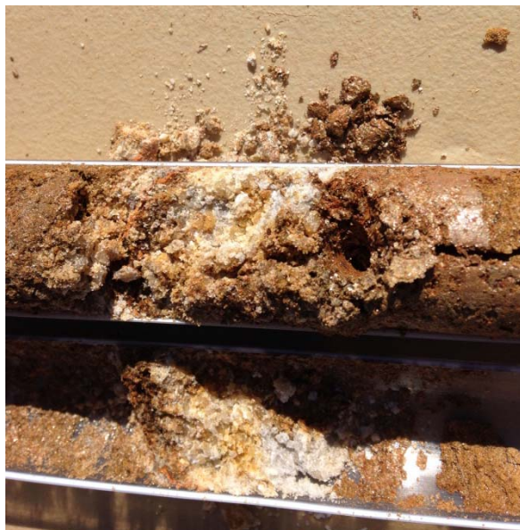
Soil from a bore hole in November 2013

After borings are completed, the holes are filled with bentonite grout.