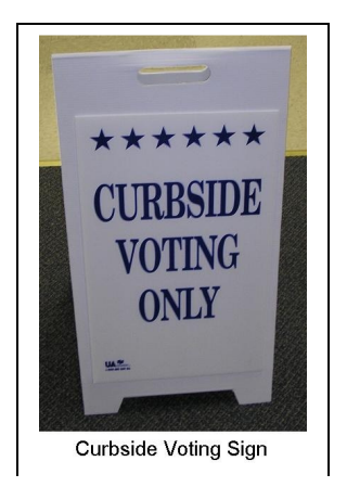
Curbside Voting Sign