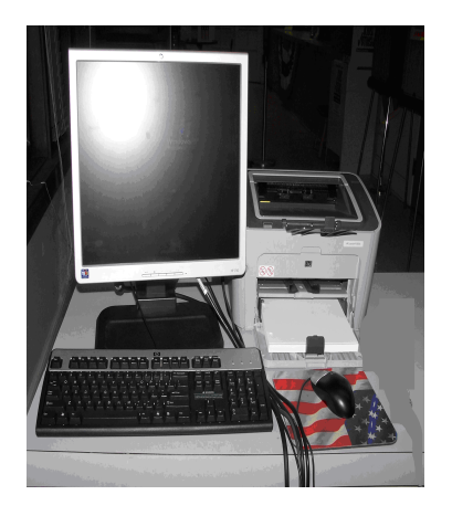
OVRD Work station