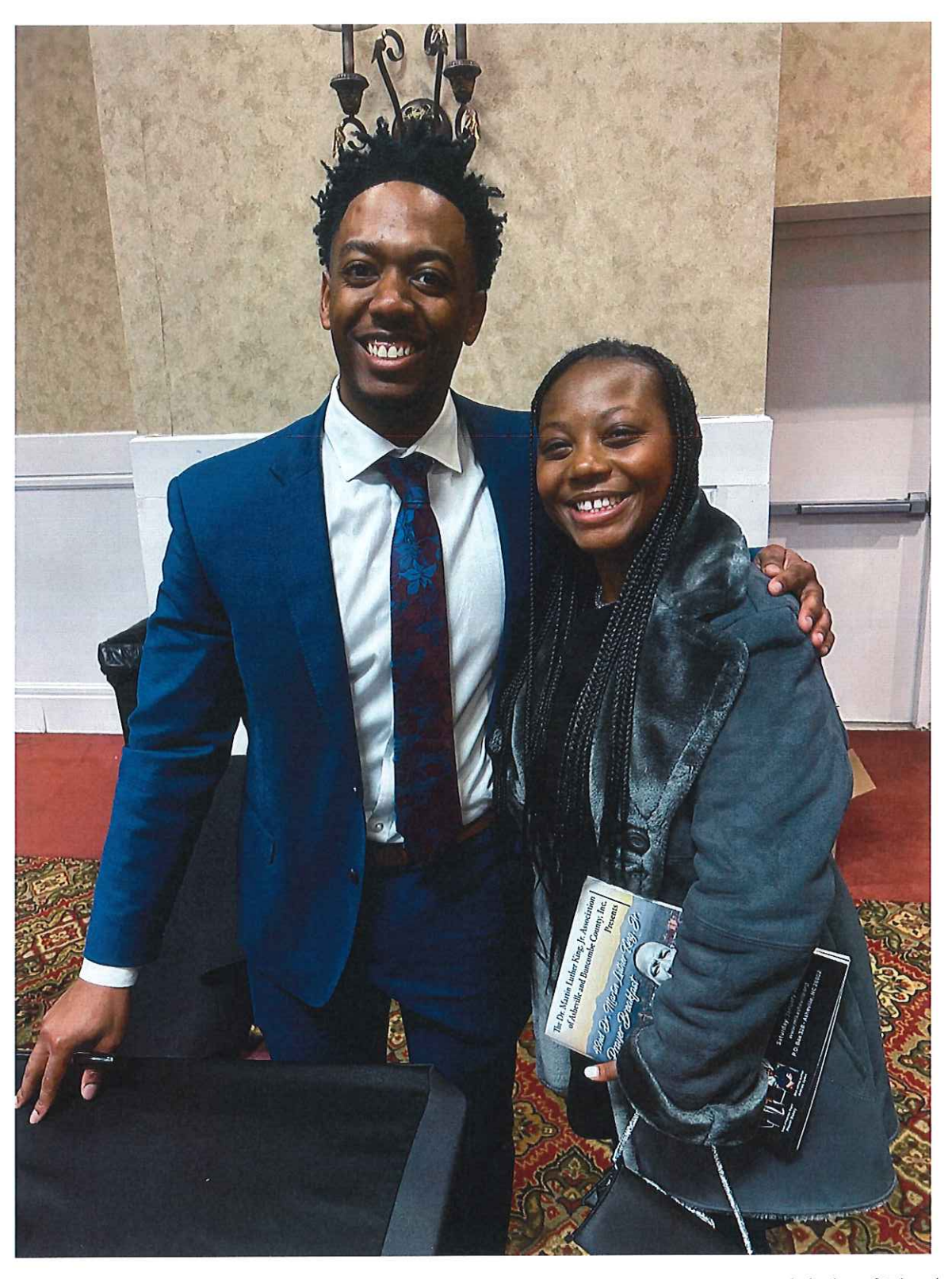
One of the Guest Speakers at MLK Jr. Prayer Breakfast, Mayor Preston Blakely of Fletcher County.