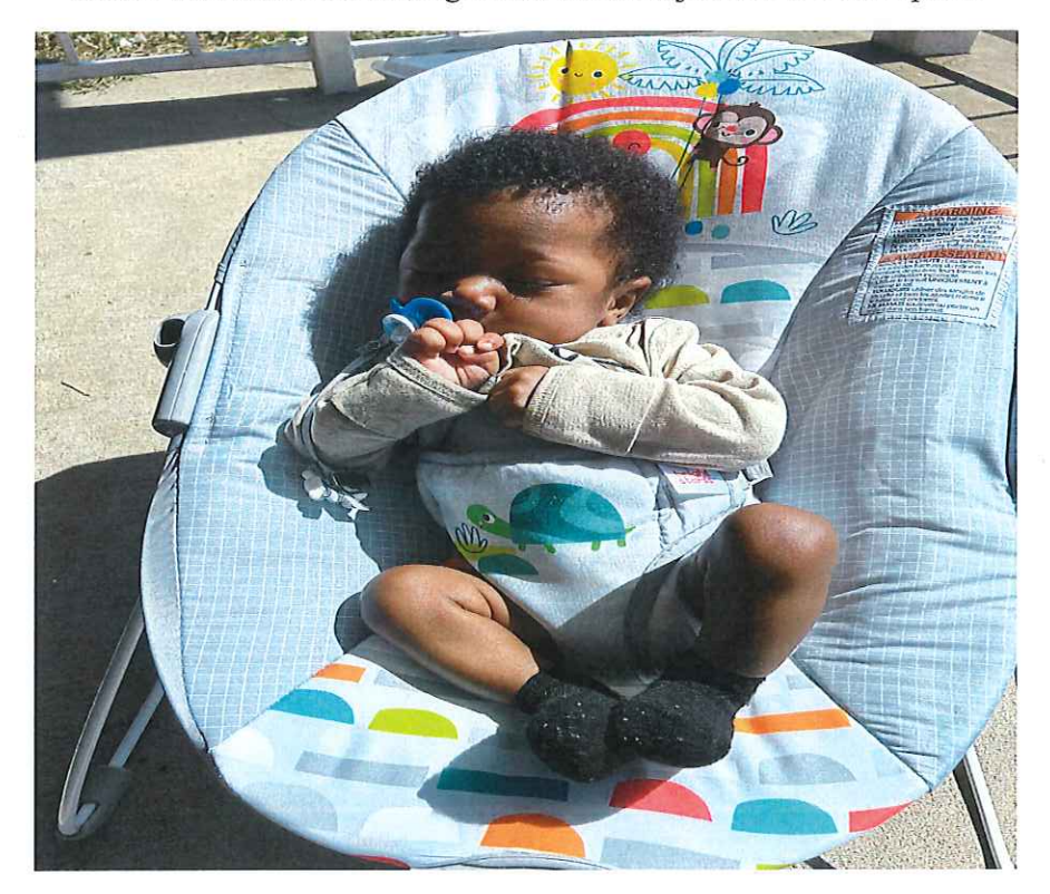
Project NAF Baby taking a nap during home visit with Participant.