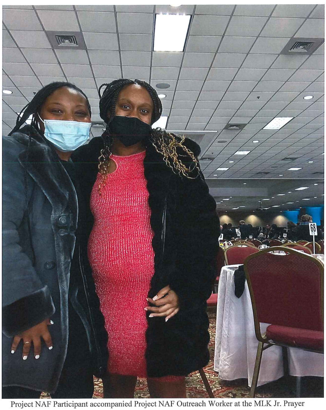
Breakfast on January 14, 2023