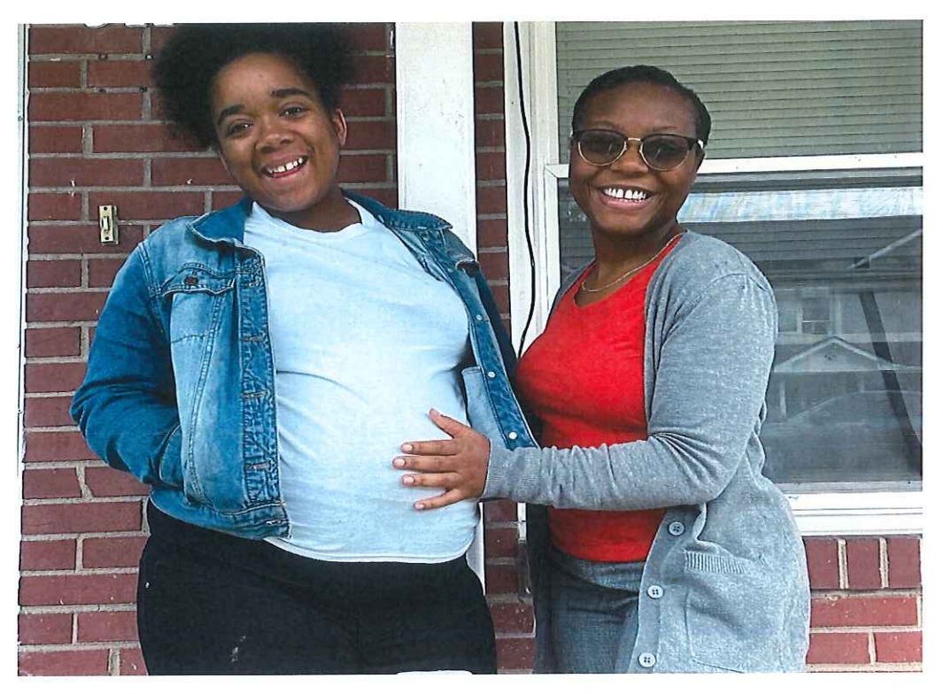
Home visit with Project NAF Participant that's due any day now. Wishing this mom, a healthy and safe labor and delivery.