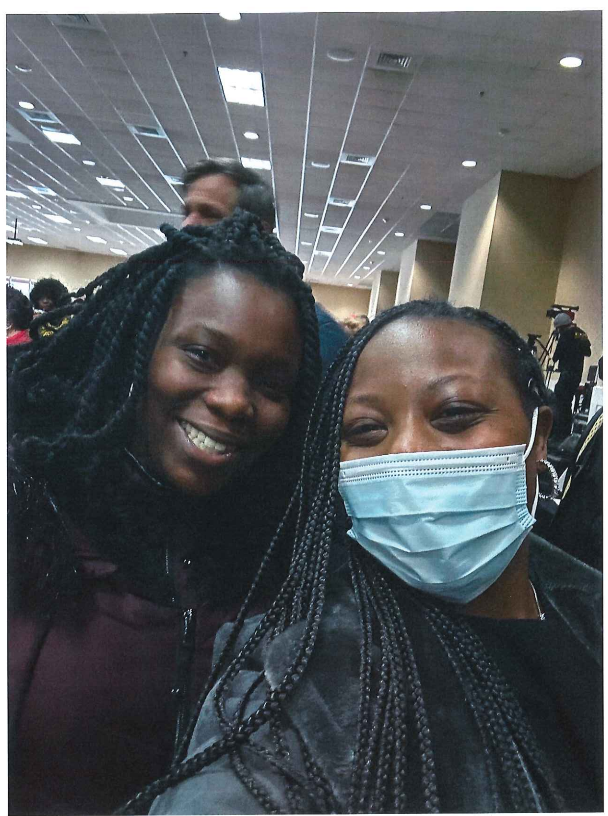
Project NAF Outreach Worker with Former Project NAF Participant.