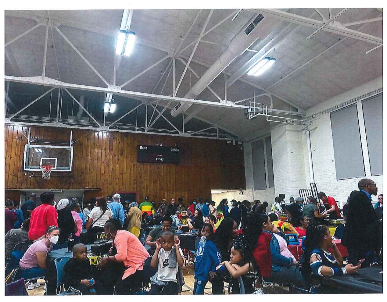
Outreach and collaboration at the Back History Month Supper at the Stephens Lee Recreation Center.