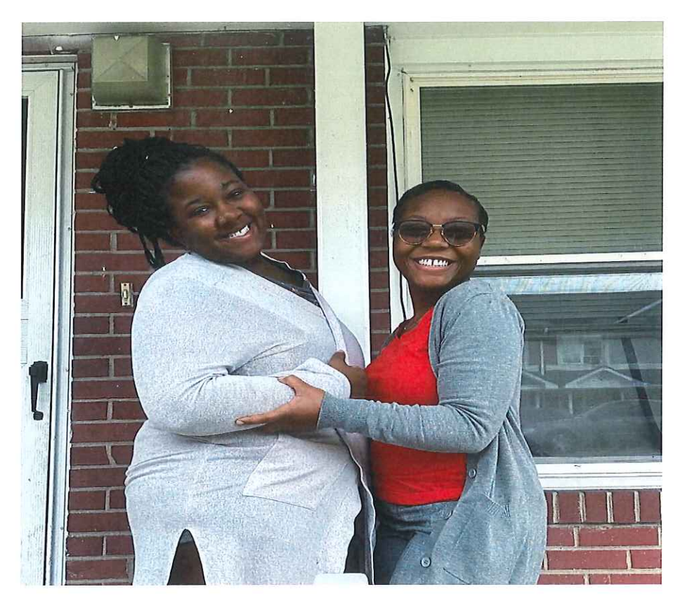
Home visit and case management with Project NAF Participant.