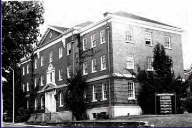
The Interchange Building.