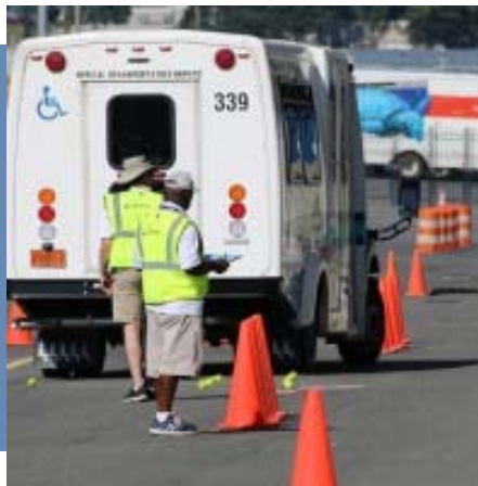
2017 Roadeo Team