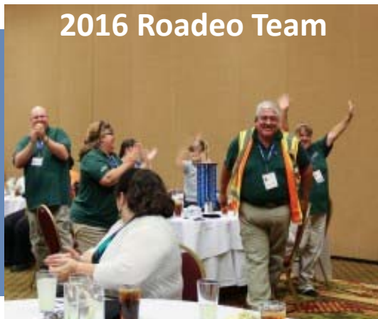
2016 Roadeo Team