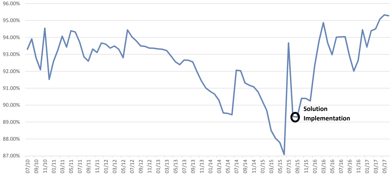
On-Time Performance by Month/Year