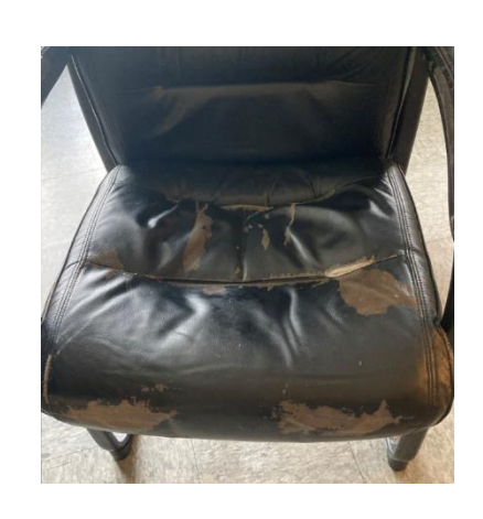
Chair leather is coming off on chair in Adult Day Activity Center.