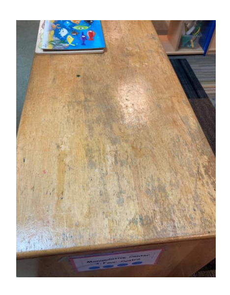
Top of table varnish came off in ELC classroom.