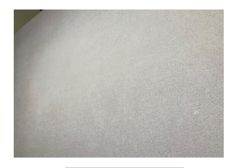
Chair from Adult Day Activity Center is spotted.