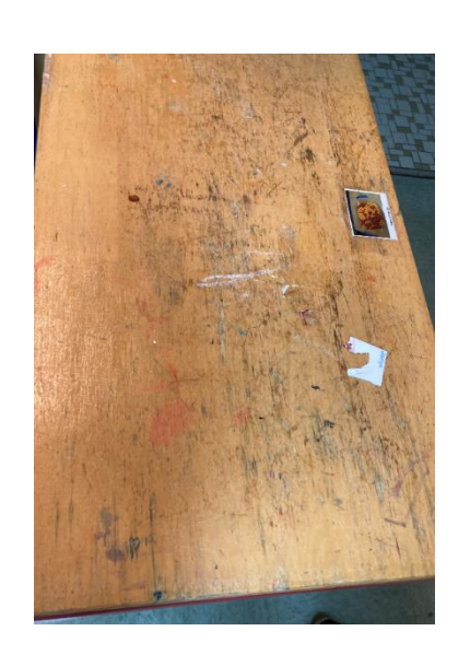
Top of table varnish came off in ELC classroom.