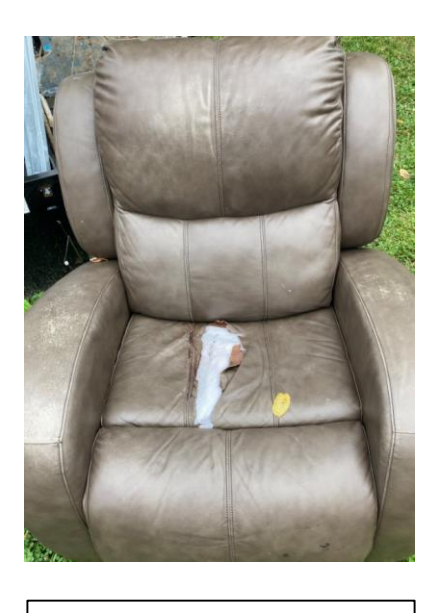
Chair from Adult Day Activity Center weakened and ripped.