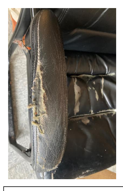
Chair from Adult Day Activity Center weakened and ripped.

Due to Covid-19 disinfecting protocol, much of the furniture in our Early Learning Center classrooms and Adult Day Activity Center has been compromised. Here are a few photos showing some of the damage caused by the disinfecting liquid bleach, which was used per protocol. These photos only show a few examples of the total damage.