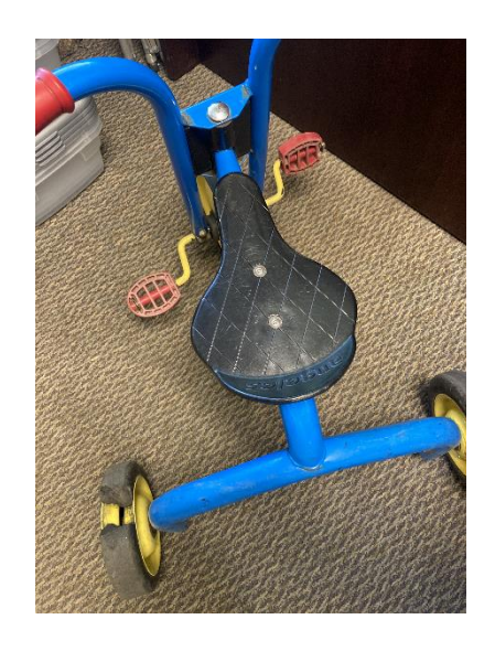
Left wheel broke off of ELC bike.