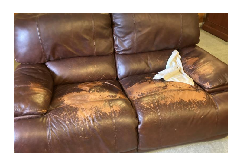
Couch from Adult Day Activity Center is spotted.