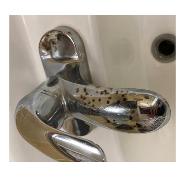
Faucet rusted in ELC bathroom.