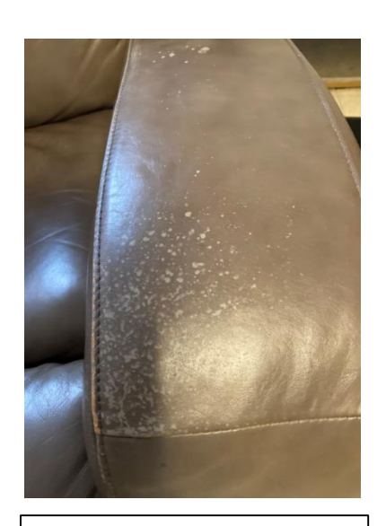
Chair from Adult Day Activity Center is spotted.