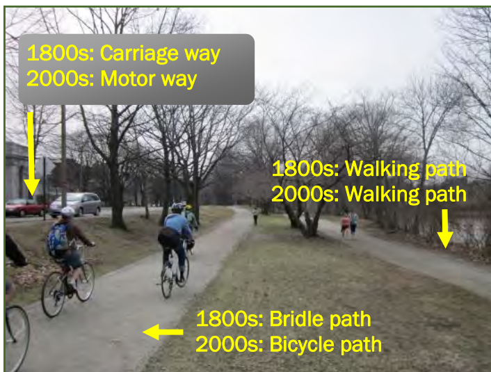
Exhibit 1-1: The Back Bay Fens, Boston. Led by Olmsted in the 1800s, the Fens has timeless design that has accommodated modernization and changes in users over the course of 150 years.

These design considerations are not just related to the volume of use, but the type of use, the destina-