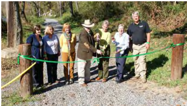
The ribbon-cutting for the trail at Alexander Park in 2011 brought about a new era for Buncombe County as it is the first greenway segment constructed and managed by the County.

Before the planning process began, Buncombe County identified several themes to examine during the course of the effort. An integral, over-arching theme was one of creating a meaningful, vibrant and affordable practice today that does not deplete the County's resources for tomorrow. This must be achieved in a fiscally responsible way and with an outcome that is compelling and understood by the people who use it and need to live with it. These themes are consistent with those found in the County's Land Use Plan and Sustainability Plan.