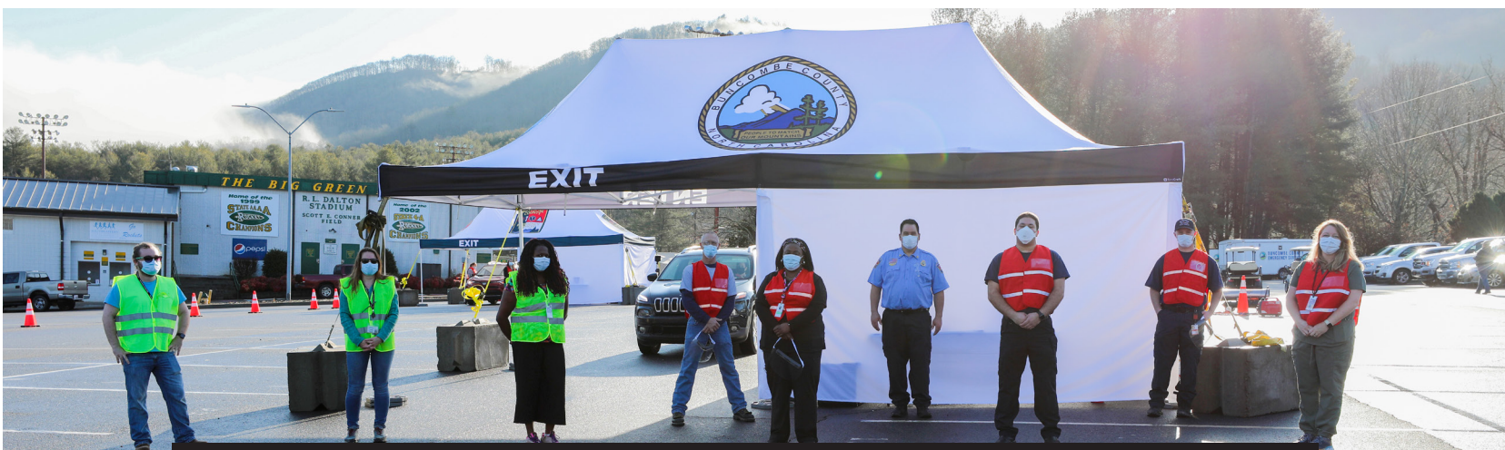
EMS - Health - Economic Services staff assist at drive-thru COVID-19 Vaccine clinic at AC Reynolds High School

AB Tech, Buncombe County Schools, and Biltmore Church South assisted in the mass vaccination efforts through the use of their facilities. Vaccination efforts were operated from these locations beginning January 2021 and lasted until summer of 2021. Many County staff were reassigned from other departments to assist with registration and decontamination, putting them right in the middle of this historic event. Highlights of this time period include an extended visit by the Mexican Consulate, a visit by Governor Roy Cooper, Buncombe County staff and volunteer engagement, and growing partnerships to support our community's health. This was a tremendous effort by all involved, worthy of its own annual report.