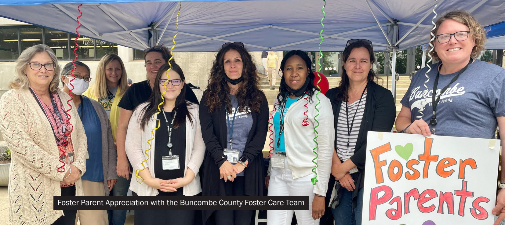
Foster Parent Appreciation with the Buncombe County Foster Care Team