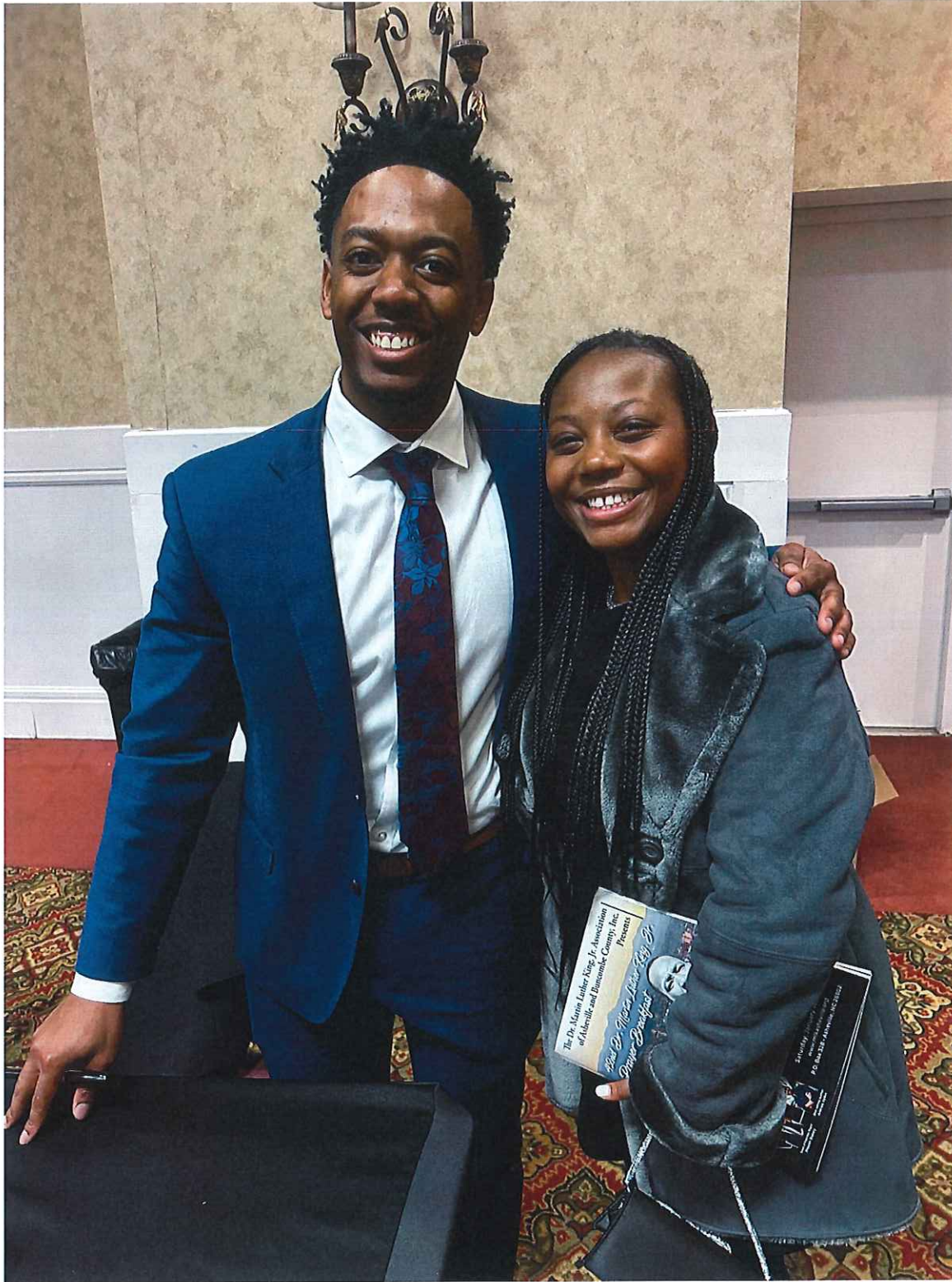
One of the Guest Speakers at MLK Jr. Prayer Breakfast, Mayor Preston Blakely of Fletcher County.