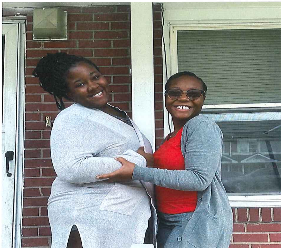
Home visit and case management with Project NAF Participant.