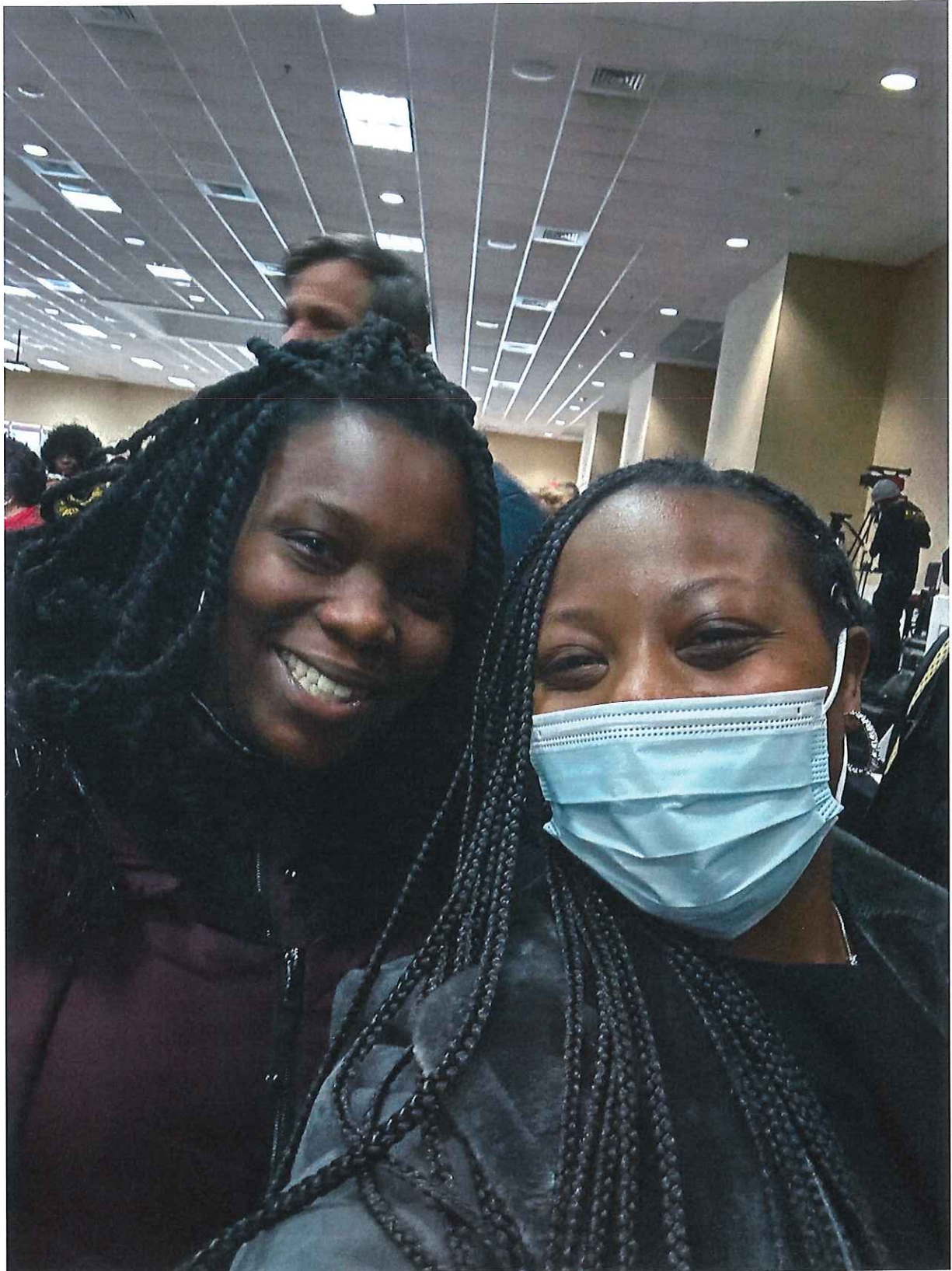
Project NAF Outreach Worker with Former Project NAF Participant.