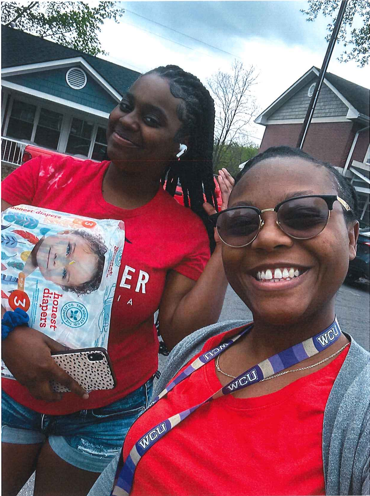
Case management visit with Project NAF Participant. Dropping off essential needs for baby, diapers.