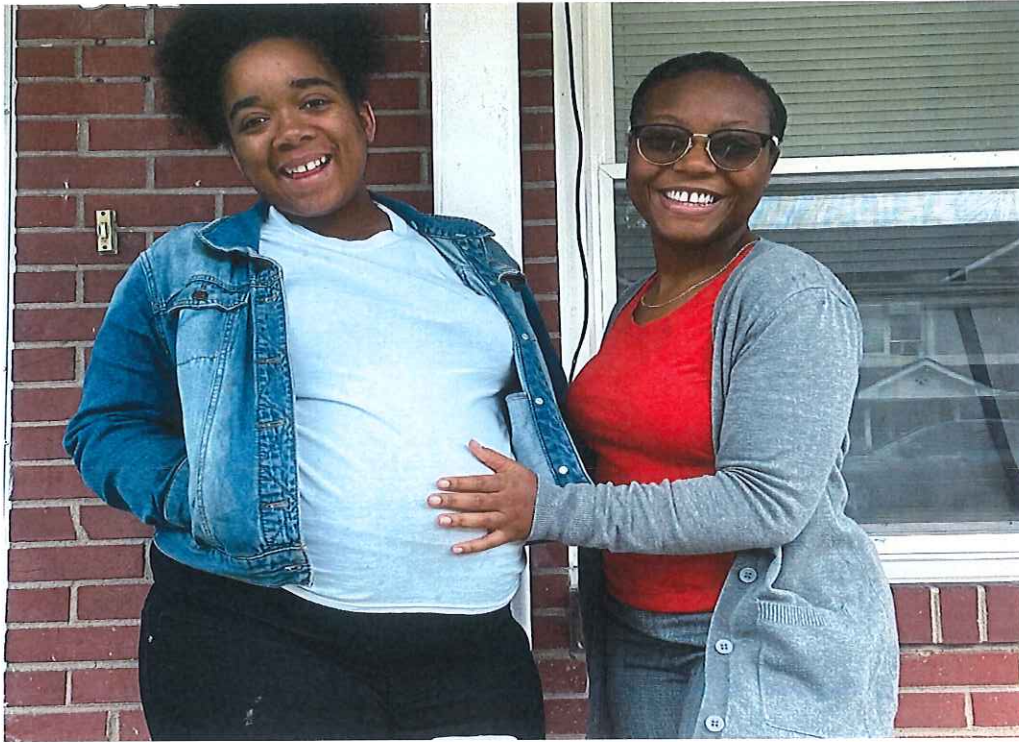
Home visit with Project NAF Participant that's due any day now. Wishing this mom, a healthy and safe labor and delivery.