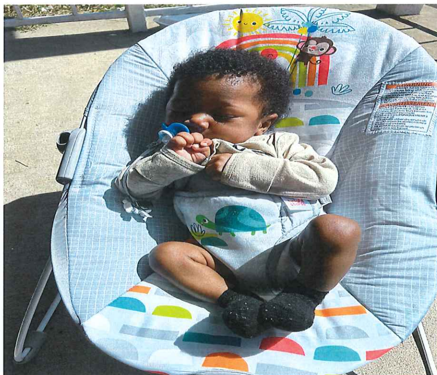
Project NAF Baby taking a nap during home visit with Participant.