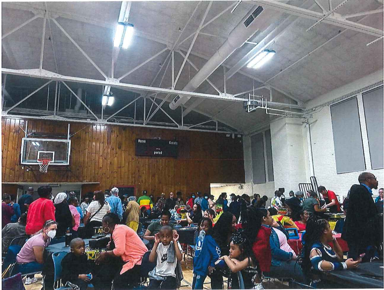
Outreach and collaboration at the Back History Month Supper at the Stephens Lee Recreation Center.