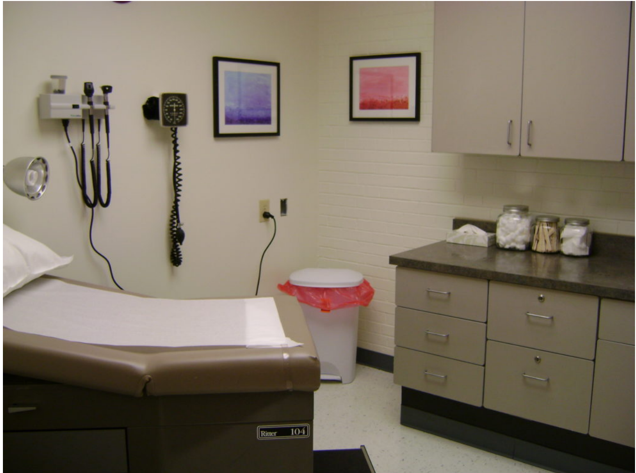
Example of a School Health Center.

SHCs are essentially doctors' offices located at a school. They can be located in a repurposed classroom space or a standalone structure on the school property. They employ at least one advanced practitioner—a physician, physician assistant and/or nurse practitioner—to see students throughout the school day. The main goal of SHCs is to provide greater access to medical care while minimizing the amount of time students have to be out of a classroom to receive that care.