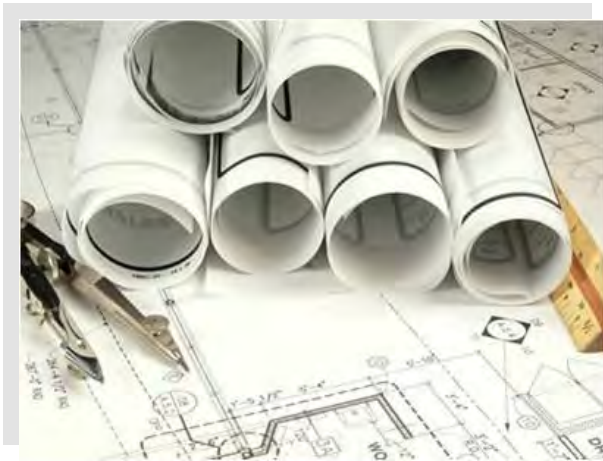
Many communities require new development to dedicate land planned for greenways as part of the plan review and approval process.

tion and that the area be counted toward the open space requirement for the proposed development. The local jurisdiction (county or city/town) would be responsible for constructing and maintaining the greenway but would not incur the expense of purchasing the property. An understanding on the part of the property owner/developer of the benefits of having a greenway located within the development that would connect to other uses and destinations in the community should offset any concerns about the required dedication of the property. An additional benefit is that the greenway would be constructed and maintained by the local government.