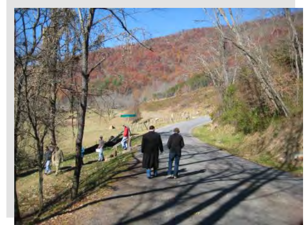
Walking a property that is subject to some type of acquisition for a greenway can provide insight for property owners and designers about specific concerns related to the proposed greenway.